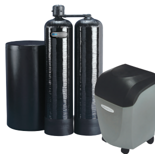
POE & POU Water Softeners

KineticoPRO® offers a complete range of commercial water treatment solutions. Based on a per-location water analysis, we will work with you to prescribe the ideal water filtration, softening, and reverse osmosis solutions to optimize your water quality and protect your equipment.