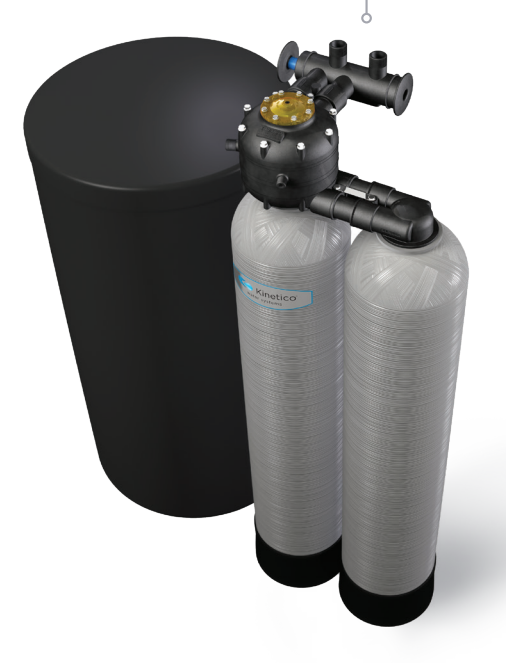
Model Shown: 735